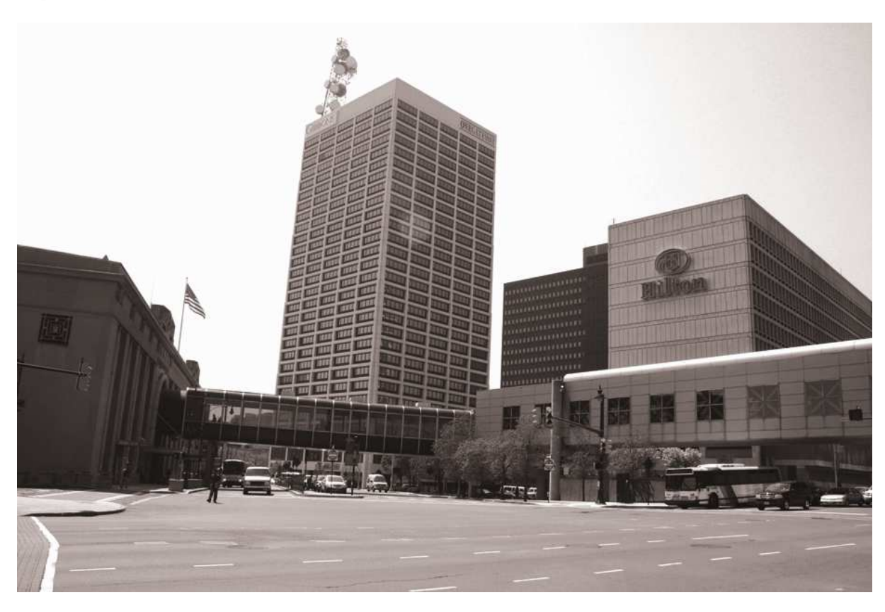
Figure 2 A skywalk connecting Penn Station and the Gateway project.

city centres, were brutally implanted in downtown according to the opportunities of real estate at the moment of their realisation. Their detachment from the city fabric and city life was enhanced by skywalks connecting the towers to each other and directly to Newark's Penn Station, allowing commuters to avoid the city's streets altogether [fig. 2]. Security and monitoring as a means of preventing unwarranted visitors completed the total detachment of the Gateway buildings from the city, rendering them a fortress rather than participant in Newark's life. More recently, the New Jersey Performing Arts Center (NJPAC) and the hockey arena have been major projects which required a large investment of public funds, projects which called attention to the disparity between their public cost and their limited benefit to Newark itself. All these projects also represent the fragmented and partial solutions sought by city government in recent decades which did little to help the city.