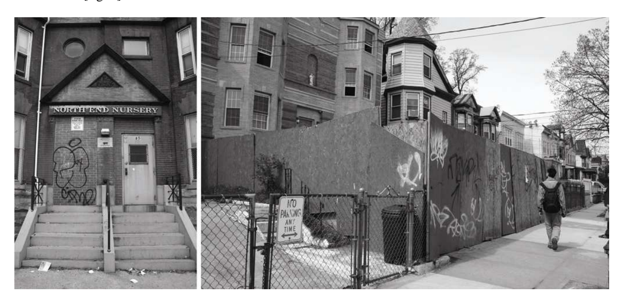
Figure 3 Newark is hard hit by foreclosures.

More recently, the 2000 census showed that the number of inhabitants had stopped its decrease, and city administrators, emulating other regenerated cities, rushed to name Newark 'Renaissance City'. However, the 'Renaissance City' label demonstrates the questionable belief that the city's difficulties are caused by the bad image of Newark rather than by real problems, and that the solution therefore is within the realm of the mind and could be addressed by city branding. In any case, the election in 2006 of the Obama-clone Cory Booker as Mayor further encouraged certain optimism. The rise of real estate prices in Manhattan, the spillage of Manhattan into Jersey City and Hoboken, raised hopes that Newark would finally benefit from the prowess of Manhattan's real estate market. These hopes were scuttled by the recent crisis, with Newark hard-hit by foreclosures [fig. 3].<sup>6</sup>